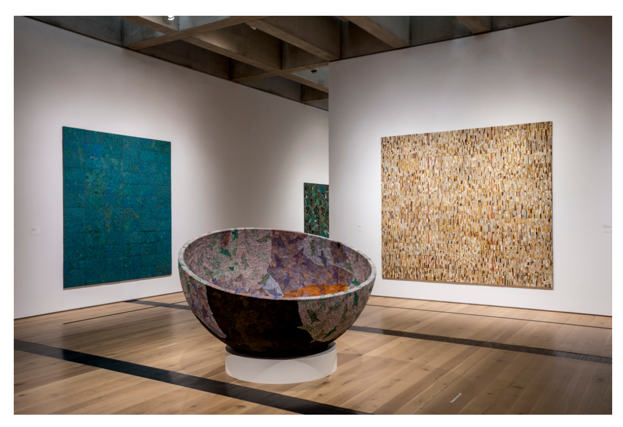
Installation view, Elias Sime, Currents 118: Elias Sime, Saint Louis Art Museum, July 31, 2020 - January 31, 2021

Elias' recent solo exhibition at the Saint Louis Art Museum includes two large, inverted half globes, covered with woven electrical wires. One of these half globes is entitled Tightrope: EYES and EARS of a Bat (2020). He said, "Bats hang upside down. To a casual observer, this unusual standing position is discomforting. To the bats, it is their natural position. I often wonder if the hollow shape of the caves' interior is what gives the bats a sense of comfort. Similarly, the ideas amplified through megaphones can be comfortable to some and disturbing to others." These half globe pieces, influenced by the Native American Cahokia Mounds and the St. Louis Gateway Arch, are about humanity's urge to let the future generations know that they were there. Just like these monuments, ideas amplified through the megaphone can impact many generations into the future.