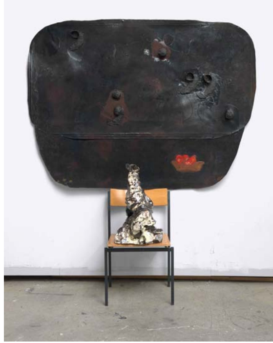
JESSICA JACKSON HUTCHINS 杰西卡·杰克逊·哈钦斯 Dinner Theater 晚宴劇场, 2012 Collage on canvas, glazed ceramic, chair 布面拼贴、上釉陶瓷、椅子 85 1/2 x 72 1/2 x 21 inches; 217 x 184 x 53 cm