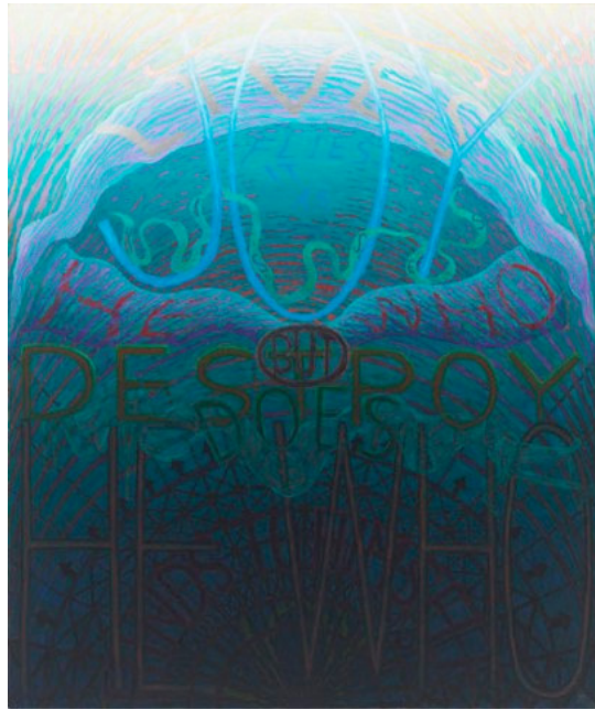
He who binds to himself a joy (Blake) 2014 oil on canvas 50" x 42"