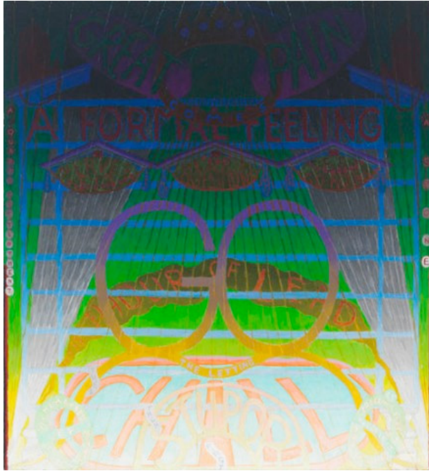
After great pain (Dickinson) 2011-2014 oil on canvas 50" x 46"