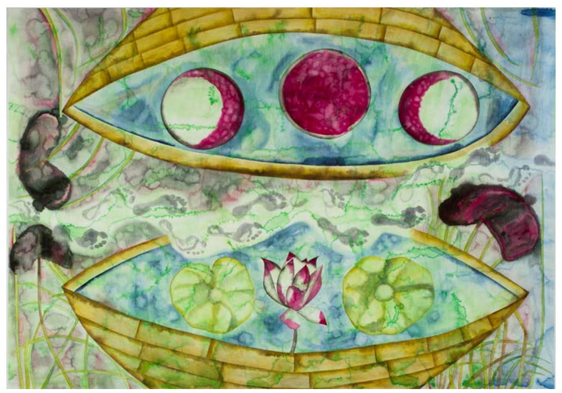
FRANCESCO CLEMENTE 弗朗切斯科·克莱门特 Second of the Three 第二个, 2011, Watercolor on paper 纸本水彩 72 11/16 x 103 7/8 inches; 184.63 x 263.84 cm

Address: 1F, Building 1, No.170 Yueyang Road, by Yongjia Road