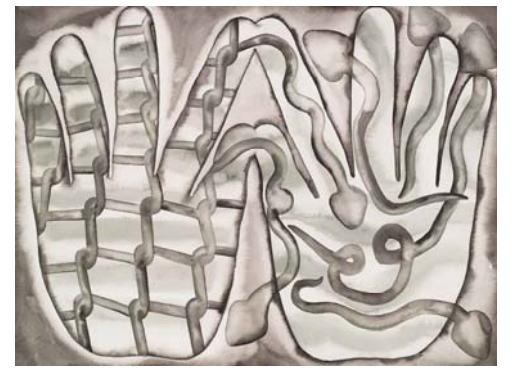
FRANCESCO CLEMENTE 弗朗切斯科•克莱门特 Snake, Net 蛇,网, 2008 Watercolor on paper 纸本水彩 18 1/8 x 24 inches; 46 x 61 cm

be filled with a repertoire of images—floating, melting, transforming, definite or tentative, single or in combination; pleasant or disquieting—stemming from his nebulous imagistic world." Clemente is a true master of seriality, as Jain also cites, "who is fascinated by the literary and musical technique of improvisation on a theme." These works on a formal level convey ideas of symmetry and duality, but also give space to intimate reflection, agility, and fluid gracefulness. The images of the palms and feet have a long tradition in both Buddhist and Hindu cultures as divine symbols of one's destiny, auspiciousness and prosperity.