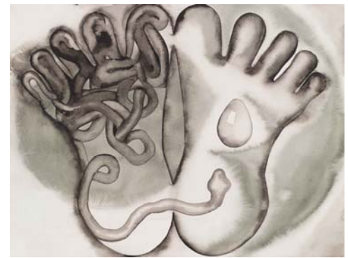
FRANCESCO CLEMENTE 弗朗切斯科•克莱门特 Ave, Ovo 玛利亚,卵, 2008 Watercolor on paper 纸本水彩 18 1/8 x 24 inches; 46 x 61 cm