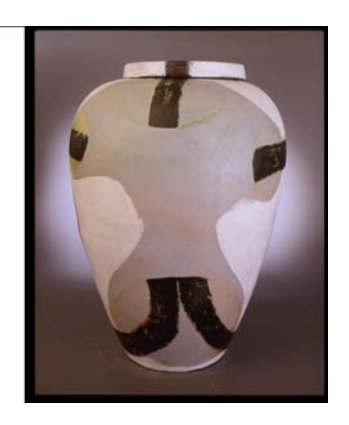
FRANCESCO CLEMENTE 弗朗切斯科•克莱门特 The Leaf of the Thief 小偷的叶子,2006 Ceramic 陶瓷 Diam 22 inches, H 28 11/16; Diam 55.88 cm, H 72.90 cm