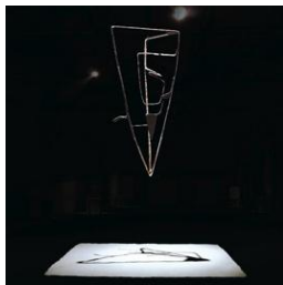
Wang Xieda, "Sages' Sayings 0901," rattan, paper pulp, ink, white sand, light, shadow, and charcoal powder, 288 x 130 x 75 cm, 2009.