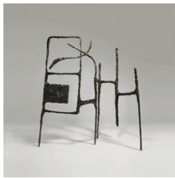
Wang Xieda, "Sages' Sayings 026," bronze, 94 x 85 x 30 cm, 2006.