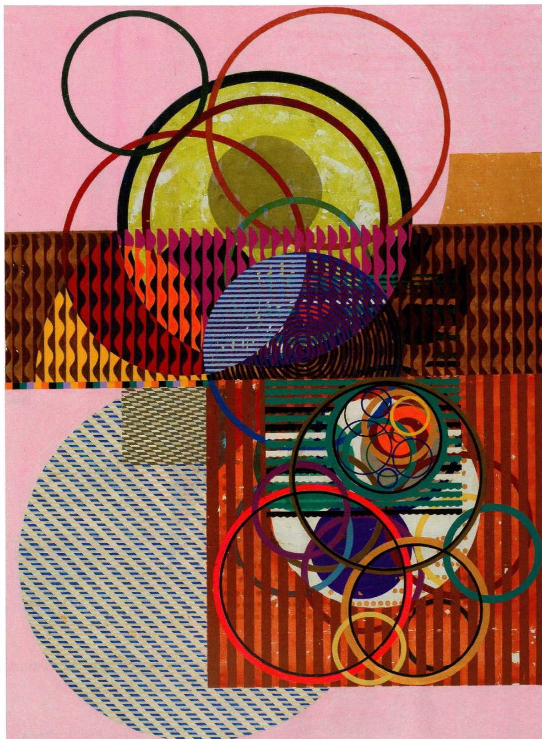
Potato Dreaming , 2013, acrylic on canvas, 118 by 78¾ inches.

Following spread, view of the exhibition "Beatriz Milhazes: Jardim Botânico," 2014-15, at the Pérez Art Museum Miami.