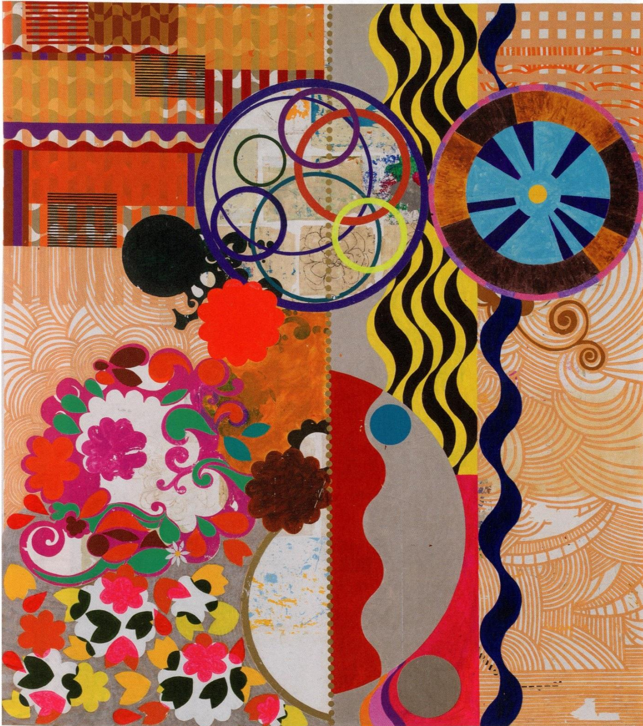
Saints Cosmas and Damian, 2014, acrylic on canvas, 87½ by 98½ inches. Private collection.